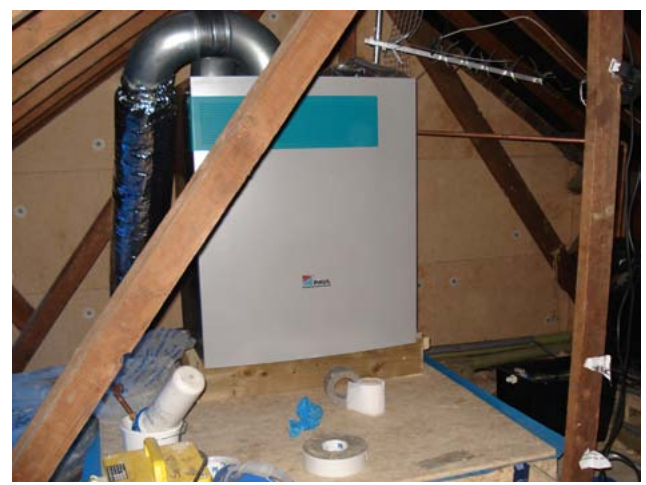
HRV unit installed in attic