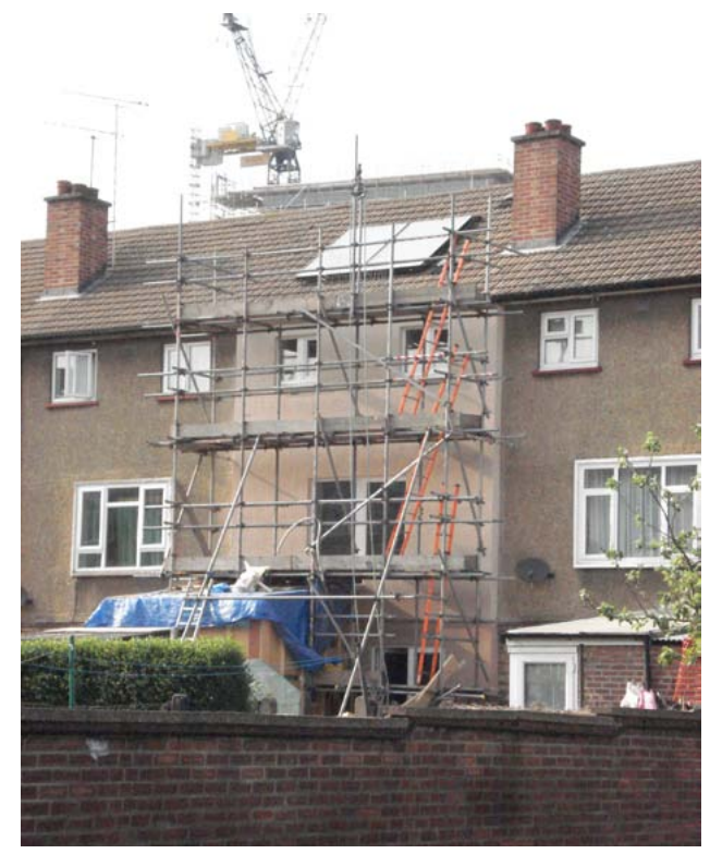
Solar thermal array installed and final render coat applied to external insulation