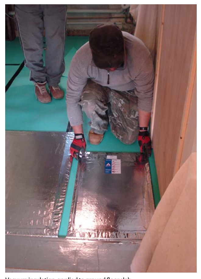
Vacuum\ insulation\ applied\ to\ ground\ floor\ slab