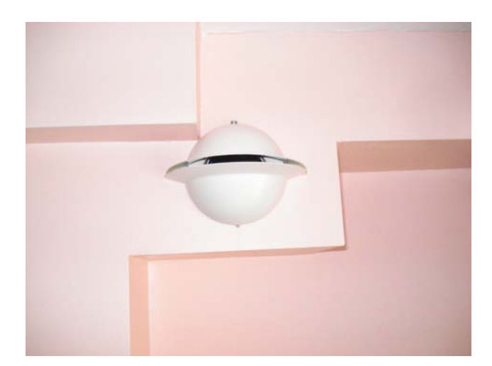
HRVU supply air diffuser