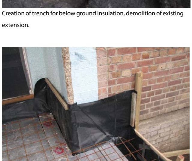
Creation \, of \, insulated \, foundations \, to \, new \, extension.