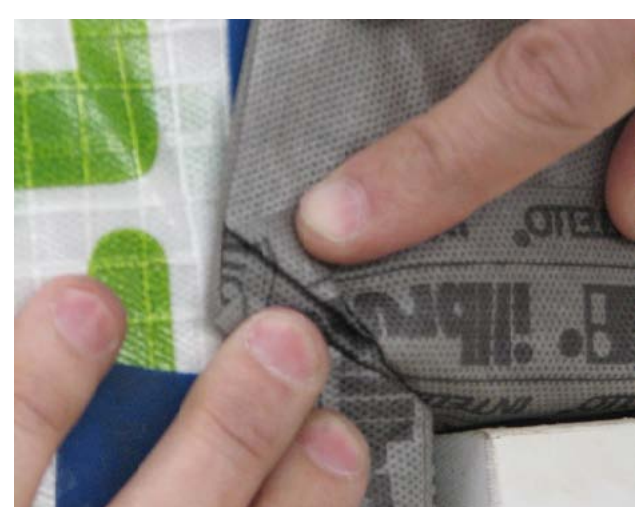
Correctly \, in stalled \, with \, {\it ``VRabbit ears''}