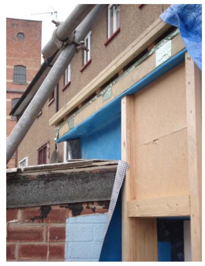
External wood fibre insulation