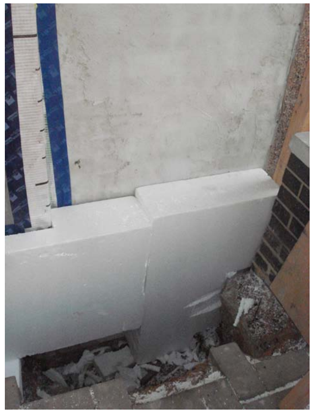
Application of parge coat and intital application of external insulation