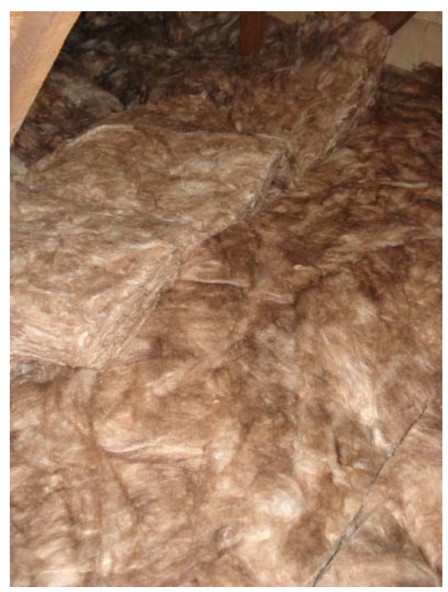
Mineral wool insulation in roof space