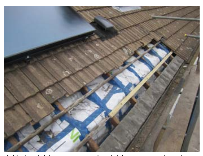
A chieving\ airtightness\ at\ eaves\ using\ airtightness\ tape\ and\ membranes