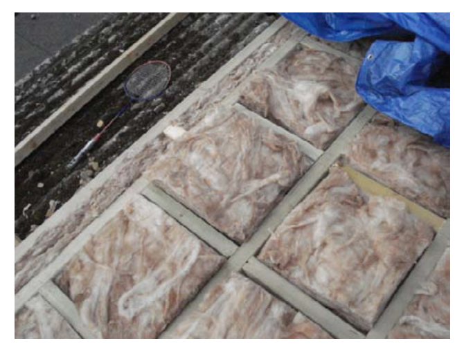
Mineral wool insulation in roof