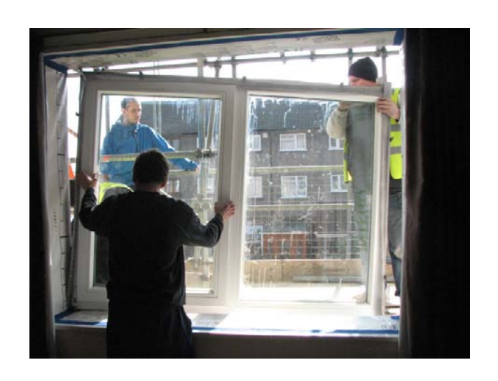
"Rabbit ears" are created in the airtightness tapes to allow the window to expand and contract without ripping the tapes.