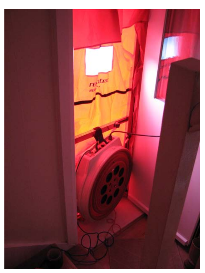
Blower fan to front door during airtest